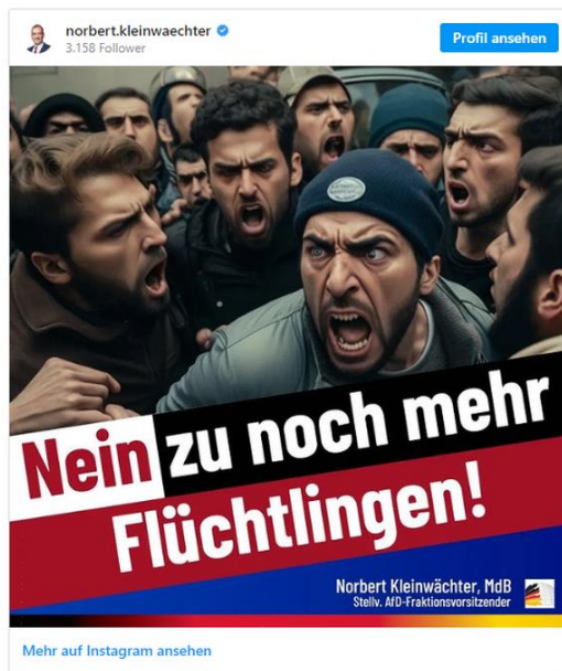
Fig. 3: Deep fakes posted by AfD politicians