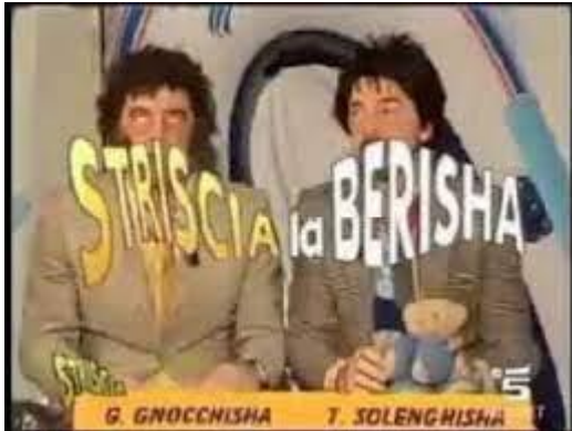
Fig. 4: Technology and populism have long been linked: The example of TV.